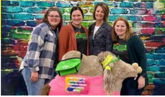
Watertown Boys & Girls Club Blue Door Derby