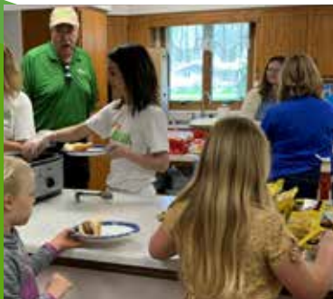
Feeding Castlewood students after the storms