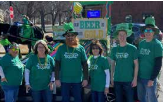
Watertown St. Patrick's Day Parade