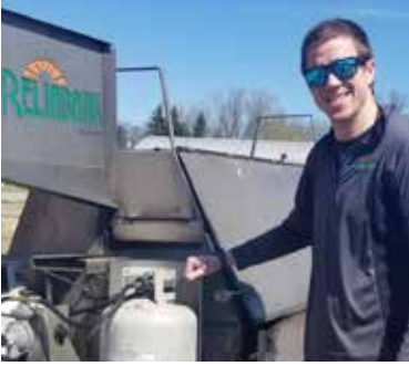
Estelline provided lunch during community clean up post storm