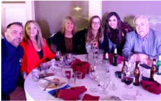
Hope Haven 'Rock N Roll for Hope'