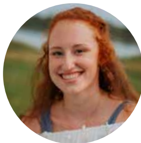
Madison Park Watertown