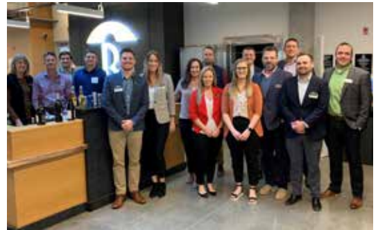
Reliabank hosted Sioux Falls March Chamber Mixer