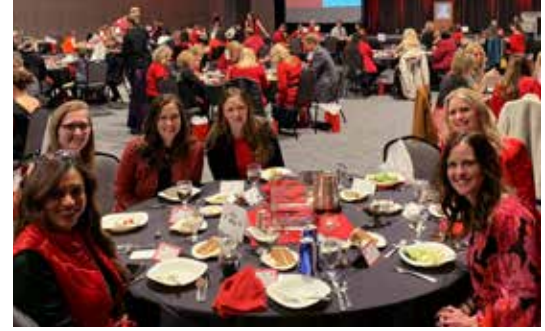
American Heart Association Sioux Falls Go Red for Women Banquet