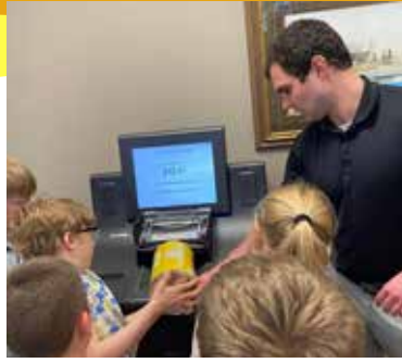
School Field trips to Estelline and Tea branches