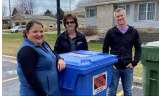
Watertown Annual Shred Event Fundraiser