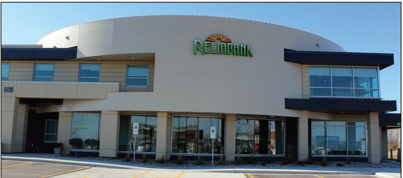
Reliabank's first full-service bank in Sioux Falls opened on Sept. 12, 2018 at 608 W. 86th St.

"We have incentive compensation laced throughout our bank," he said. "So we have got loan officers, insurance agents, wealth management people going out and asking for the business because it is good for them, it is good for the bank and it is a good product for the customer."