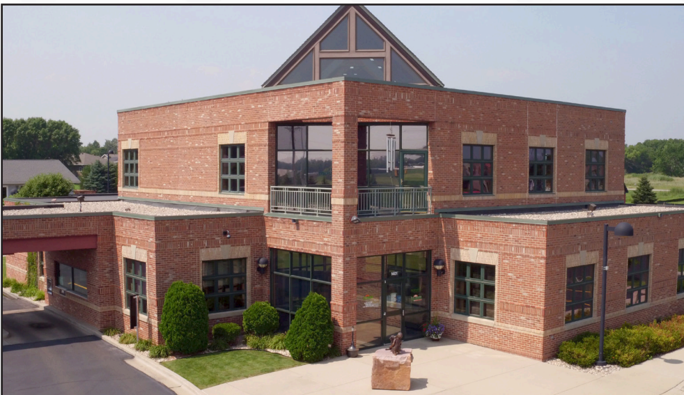
Reliabank opened its main location in Watertown at 1401 4th St. NE in 1997.

Ethan owns a four-year-old golden retriever named Bella, and his dream is to create a dog park behind the Sioux Falls bank.