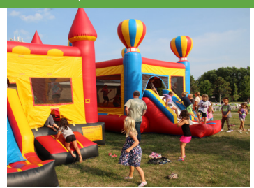
Tea Back to School Bash