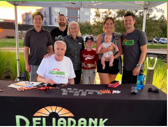
Reliabank/KXLG Summer Giveaway